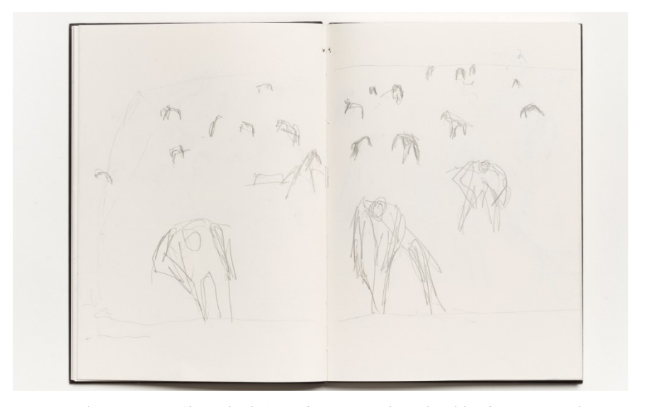
Fig. 2: Andrea Büttner, Skizzenbuch Spargelernte in Beelitz (sketchbook asparagus harvest in Beelitz), 2020, pencil on paper, 30.2 \times 21.5 \times 2.3 cm, Photo: Roman März, © Andrea Büttner / VG Bild-Kunst, Bonn 2022.