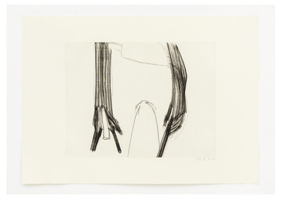
Fig. 4: Andrea Büttner, Asparagus Harvest , 2021, etching, 70 x 100 cm, Photo: Eva Herzog, © Andrea Büttner / VG Bild-Kunst, Bonn 2022.

Andrea Büttner translates the act of harvesting by drawing the seasonal workers without markings of individuality, reducing them only to body outlines and gestures. In her drawings, the artist explores the essence of physical labor, which is a prerequisite for the consumption of asparagus. While the drawings stand at the beginning of the work, Büttner continues in different techniques: in red, blue or green woodcuts (Fig. 3), the pencil strokes become white contours that stand out against the colored background. The large format – 188 x 113 cm – lifts the harvesters life-size into the picture, and yet they remain flat, faceless bodies. In her etchings (Fig. 4), Andrea Büttner isolates the hands, which stretch out towards the asparagus. The content of the picture shows a symbiotic relationship between hands and working tools, between tools and asparagus. The woodcut and etching are, as David Khalat writes, »craft printmaking techniques that are often considered inferior art forms in contemporary art« (Khalat 2021). This alludes to the value of what is produced, that of the art as well as the value of the vegetables. What is the relationship between the physical labor of harvesting and the economic return on the sale of asparagus? How does the value of the harvested produce relate to that of the physical labor?