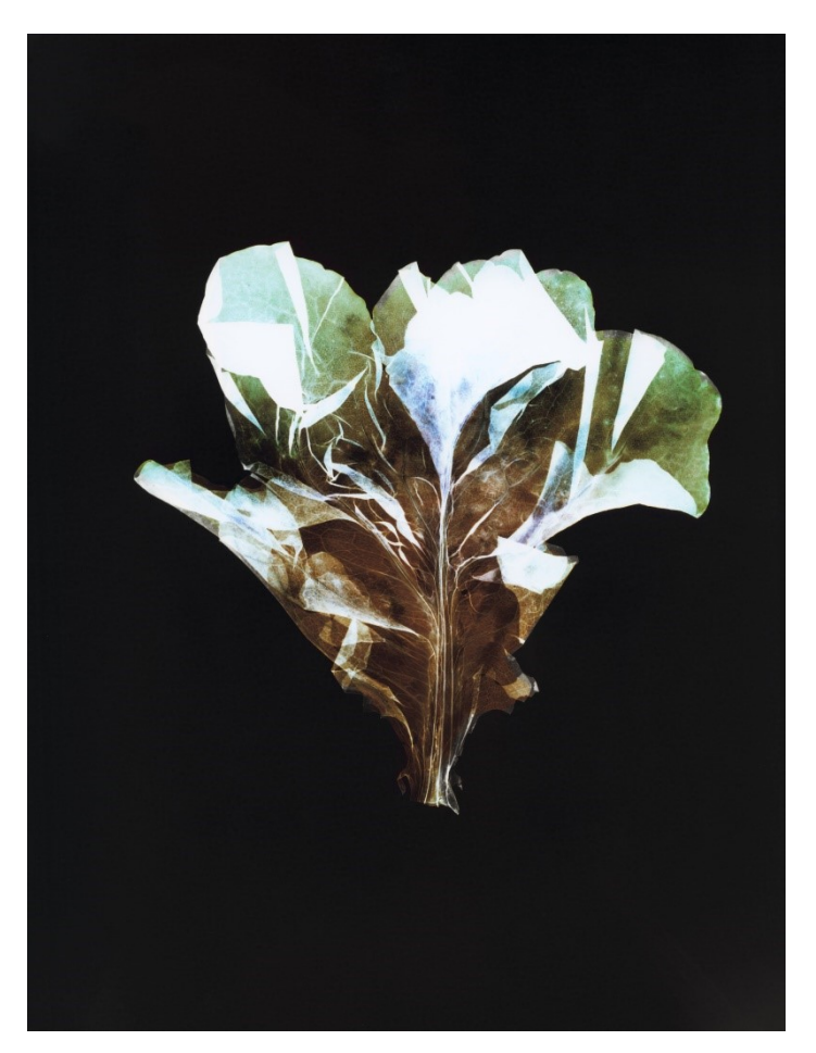
Fig. 9: Irina Ruppert, Vegetabilien Fotogramme, Lollo Rosso, 2020.

The photogram as a camera-less image production was a technique already widespread in the 19th century, when the vegetable was also a valued subject (Steidl 2019, pp. 189–259). Just as photography was read as a »pencil of nature«<sup>4</sup> – that is, as painting with light – the photogrammed natural object can also be interpreted as »made« by nature. The artistic production is thus attributed to nature.