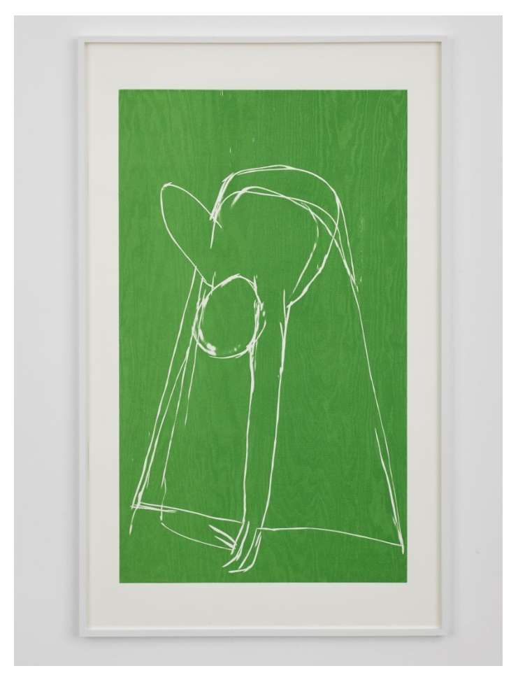
Fig. 3: Andrea Büttner, Erntende (harvester), 2021, woodcut, 188 x 113 cm, Photo: Andy Keate, © Andrea Büttner / VG Bild-Kunst, Bonn 2022.

In her sketchbook, Büttner drew contour lines with a pencil (Fig. 1) of the harvesters bending down to pick asparagus. Sometimes only the rear of the head and the rounded back can be seen, sometimes the outstretched arms or hands are visible. The drawing, reduced to a few lines, accentuates the posture, which is a condition for harvesting. In her sketchbook, the perspective opens up on two double pages and reveals the view of the field. Here, the seasonal workers each work separately, their bodies distributed across the field at regular intervals, forming a pattern (Fig. 2).